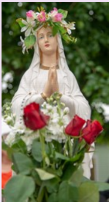
Whole School Mass Friday 24th May 2019

Our Lady of Peace Catholic Primary and Nursery School has a commit- ment to safeguarding and promoting the welfare of children.