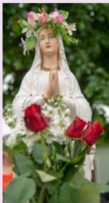
Whole School Mass

Our Lady of Peace Catholic Primary and Nursery School has a commitment to safeguarding and promoting the welfare of children.