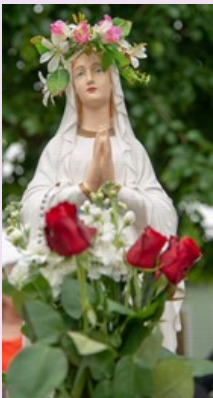
Whole School Mass Friday 25th May 2018

Our Lady of Peace Catholic Primary and Nursery School has a commit- ment to safeguarding and promoting the welfare of children.