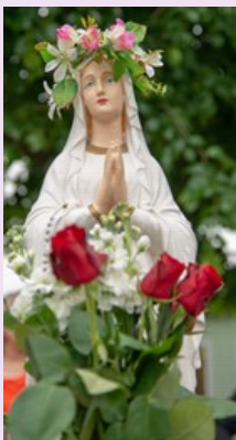
Whole School Mass Friday 25th May 2018

Our Lady of Peace Catholic Primary and Nursery School has a commit- ment to safeguarding and promoting the welfare of children.