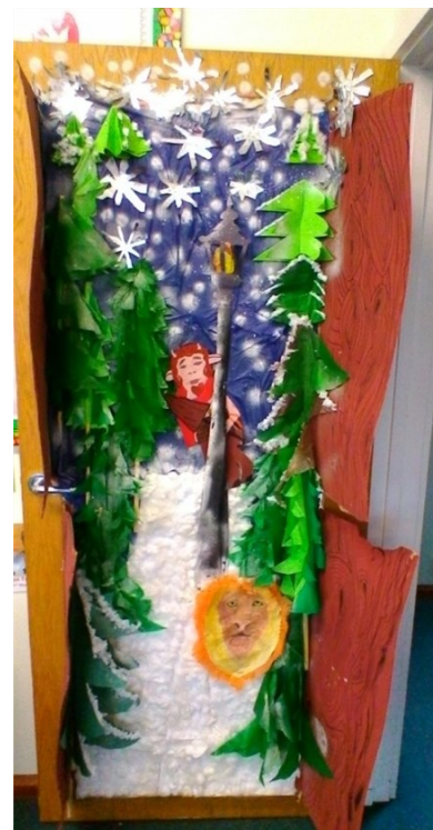
5 St Maximillian