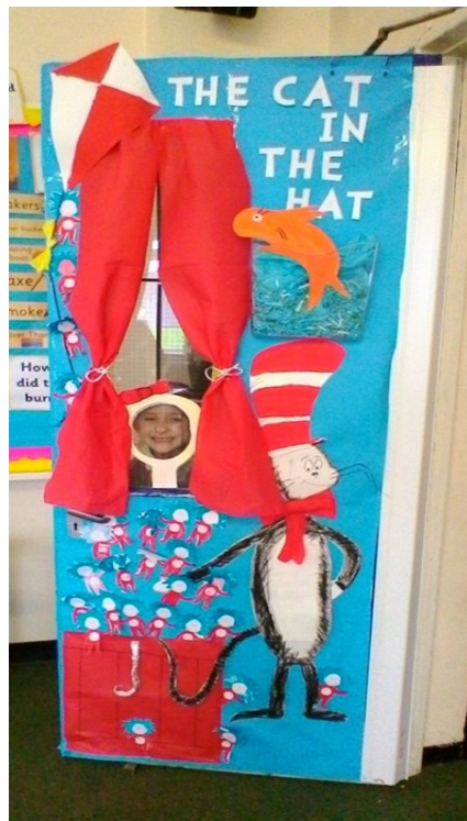
2 St Thomas Moore