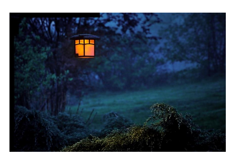
For Parents / Carers

Our Catholic Schools' Week 5 - 11 October 2020