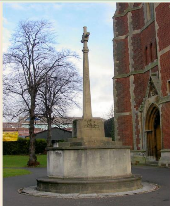
The War Memorial