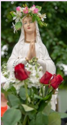
Whole School Mass Friday 25th May 2018

Our Lady of Peace Catholic Primary and Nursery School has a commit- ment to safeguarding and promoting the welfare of children.