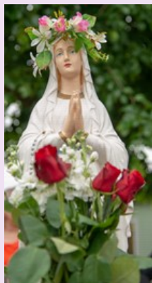
Whole School Mass Friday 25th May 2018

Our Lady of Peace Catholic Primary and Nursery School has a commit- ment to safeguarding and promoting the welfare of children.