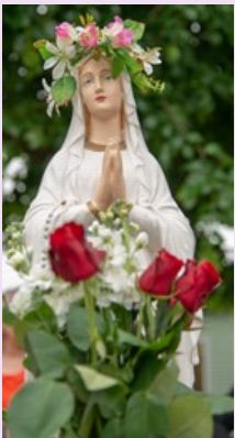
Whole School Mass Friday 25th May 2018

Our Lady of Peace Catholic Primary and Nursery School has a commit- ment to safeguarding and promoting the welfare of children.