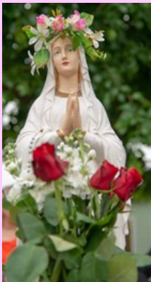
Whole School Mass Friday 24th May 2019

Our Lady of Peace Catholic Primary and Nursery School has a commit- ment to safeguarding and promoting the welfare of children.