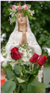
Whole School Mass Friday 25th May 2018

Our Lady of Peace Catholic Primary and Nursery School has a commit- ment to safeguarding and promoting the welfare of children.