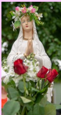
Whole School Mass Friday 24th May 2019

Our Lady of Peace Catholic Primary and Nursery School has a commit- ment to safeguarding and promoting the welfare of children.