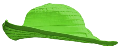
A sun hat if it's sunny!