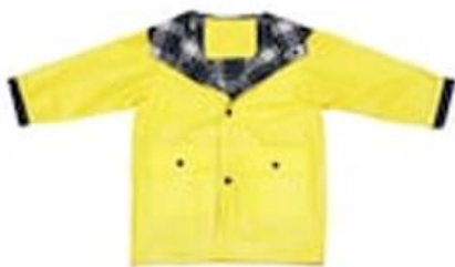
A coat if it is raining