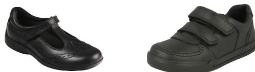
Wear school shoes that you can fasten yourself