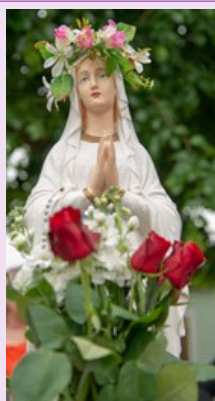
Whole School Mass Friday 25th May 2018

Our Lady of Peace Catholic Primary and Nursery School has a commit- ment to safeguarding and promoting the welfare of children.